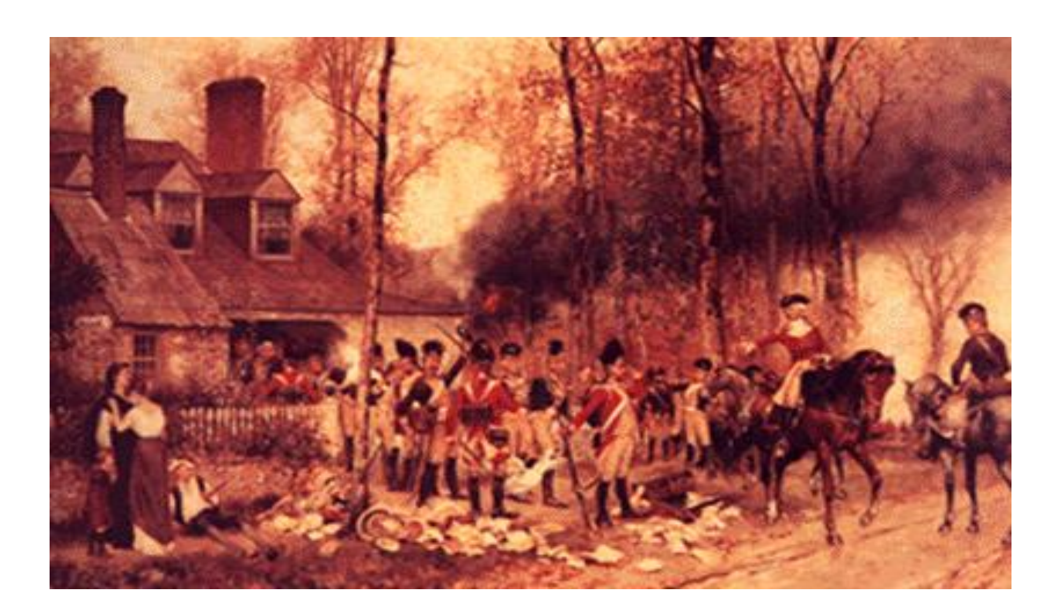
English soldiers search an American settler's house (1770's). http://www.uruknet.info/index.php?p=61993 . Military Resistance 8A5. June 30, 2010